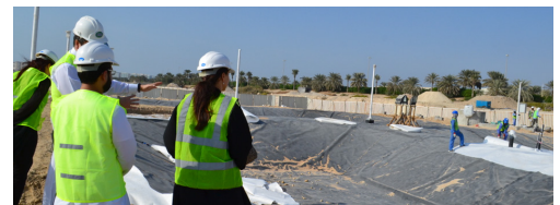
Figure 2.1 Project site at Masdar Institute of Science and Technology.